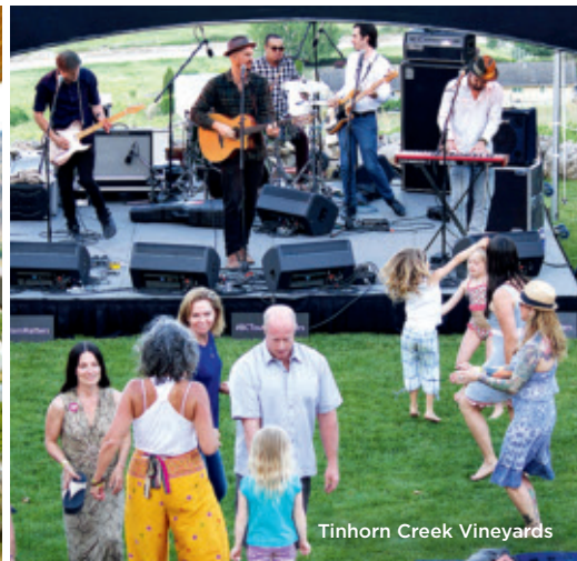
Tinhorn Creek Vineyards